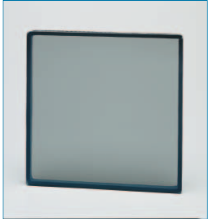
Vistacool™ (2) Solargray® glass from PPG offers subtle reflectivity and an elegant light-gray tint without sacrificing visible light performance. The Vistacool coating not only transmits higher levels of daylight, but due to its color neutrality, also serves to amplify and enrich the tint of the Solargray glass substrate underneath, creating a crisp, clean, pristine exterior aesthetic.

Architects can extend the range of performance options associated with Vistacool (2) Solargray glass by combining it with Sungate® 500 Low-E glass, or Solarban® 60 and Solarban® 70XL Solar Control Low-E glasses. In a one-inch insulating glass unit, Vistacool Solargray glass and Sungate 500 produce a Solar Heat Gain Coefficient (SHGC) of 0.35 while maintaining Visible Light Transmittance of 29 percent. With Solarban 60 glass, the SHGC is an impressive 0.28, and 0.20 with Solarban 70XL glass. Visible Light Transmittance is 27 with Solarban 60 glass and 24 percent with Solarban 70XL glass.