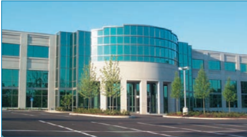
400 Berwyn Park Location: Berwyn, PA Product: Solarcool® Azuria™ Glass Architect: Garrison Architects Glazing Contractor: Hutts Glass Glass Fabricator: J.E. Berkowitz, LP