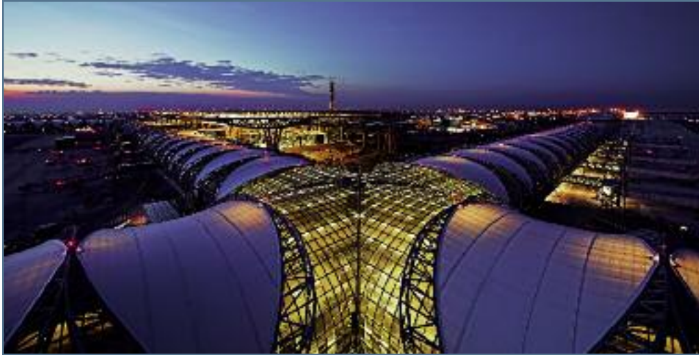
Suvarnabhumi Airport-Bangkok Airport Location: Bangkok, Thailand Products: Sungate® 500 Glass Architect: Murphy Jahn Glass Fabricator: PMK Central Glass Co., Ltd.