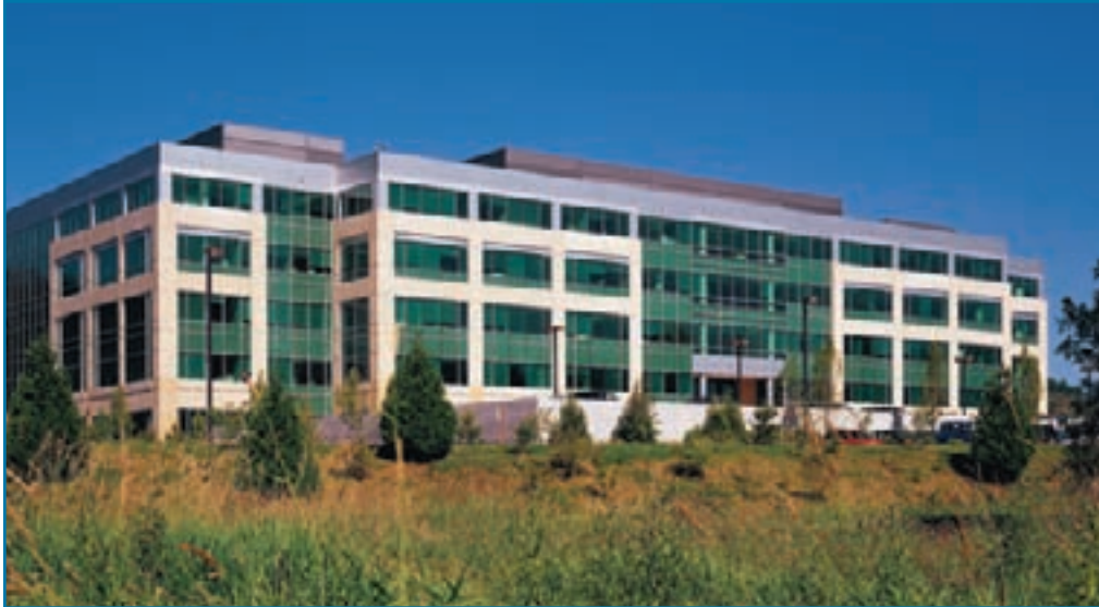
Sammamish 2A Location: Issaquah, WA Products: Atlantica™/Solarban® 60 Glass Architect: LMN Architects Glazing Contractor: Washington Glass & Glazing Glass Fabricator: Hartung Glass Industries

Atlantica™ Glass (formerly Solargreen® ) is one of the original ocean-inspired tints now featured in PPG's Oceans of Color® collection of spectrally selective tinted architectural glasses.