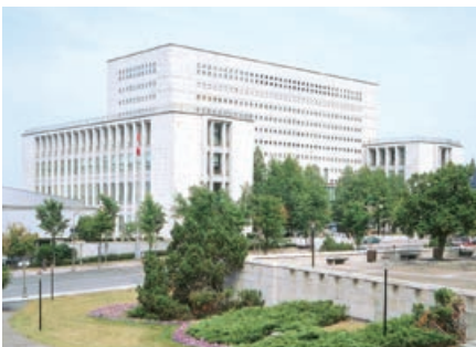
National Library and Archives of Canada