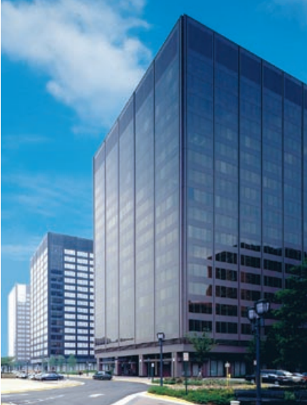
Skyline Office Building 1