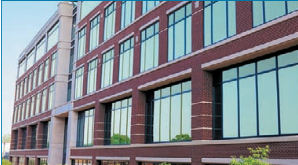
Maritime Plaza Location: Washington, D.C. Products: Solexia™/Solarban® 60 Glass Architect: HKS Glazing Contractor: EDRON Glass Glass Fabricator: J.E. Berkowitz, L.P. Owner/Developer: Maritime Plaza I, L.P./ Lincoln Property Company