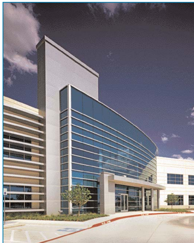
Vistacool Azuria glass, seen here on the Transwestern Gateway Corporate Center I in Coppell, TX., features a rich tropical blue tint and better visible light transmittance than similarly tinted blue glasses.

"We knew that our building would have some very strong competitors with quality architectural design," he explained. "We wanted to establish a strong presence along the highway and make a statement that would draw potential tenants, clients and brokers to the property."