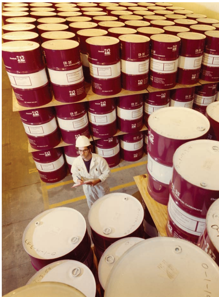
During World War II, the Columbia Southern Chemical Co. (a subsidiary of Pittsburgh Plate Glass Co.), was looking for a plastic material that would be a suitable substitute for window glass.

If we finally got lenses out of surfacing with the right power, we still had to edge them. If we weren't careful how we lowered the lens onto the diamond wheels, no matter how tight the lens was chucked, we'd torque the lens off axis. LEAP pads were supposedly our salvation, but the lenses twisted and it seems that every lens came in off-axis. Naturally, everyone's solution was to crank up the chuck pressure to the point where we left an