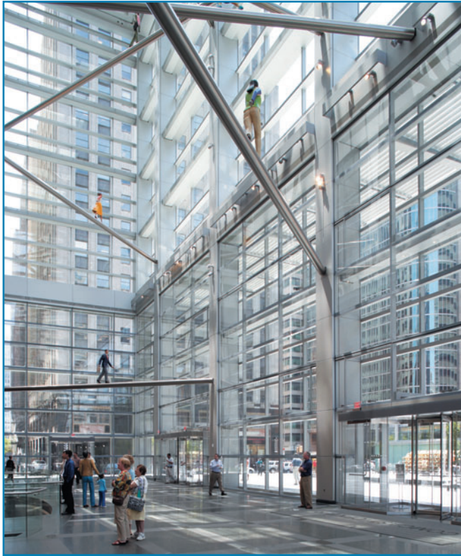
Comcast Center, Philadelphia, Pa. Architect: Robert Stern Architects LLP Glass Fabricator: JE Berkowitz, LP Glazing Contractor: Enclos

The clarity and environmental performance of Solarban 60 Starphire glass, fabricated by J.E. Berkowitz, LP, for glazing contractor, Enclos, and Robert Stern Architects LLP, are highlighted in the atrium, entryways, inset walls and crown of the soaring 62-story Comcast Center in Philadelphia.